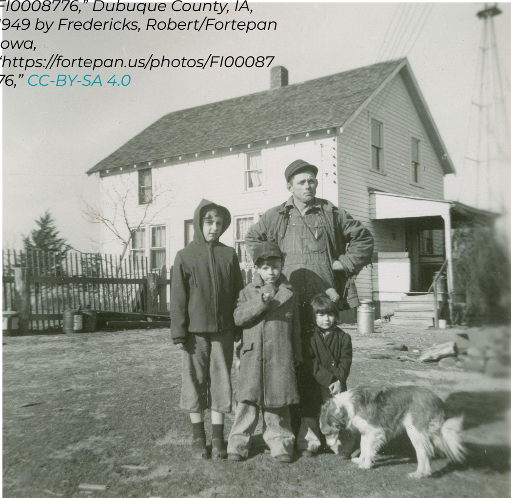
"FI0008776," Dubuque County, IA, 1949