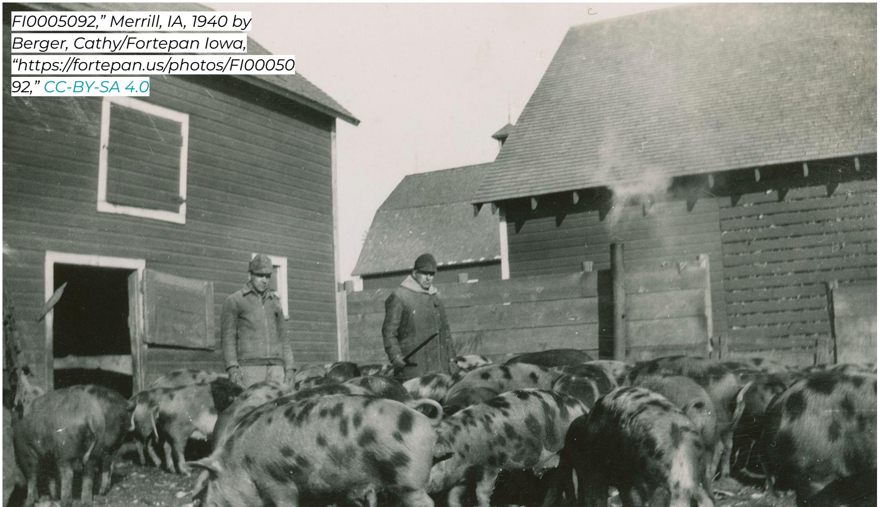
FI0005092," Merrill, IA, 1940 by Berger, Cathy/Fortepan Iowa, " https://fortepan.us/photos/FI0005092 ," CC-BY-SA 4.0