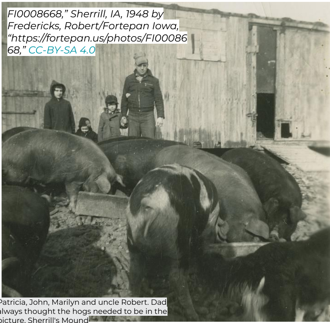
"FI0008668," Sherrill, IA, 1948